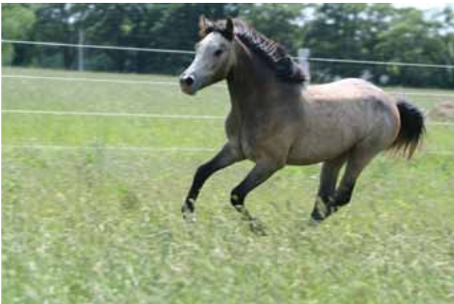
Wildwych Devil May Care (Wildwych Thunder Snow x *Glenormiston Roscrea by Oxenholm Gideon)

Also new to the farm is Wildwych Devil May Care (Wildwych Thunder Snow x *Glenormiston Roscrea by Oxenholm Gideon) a yearling colt.