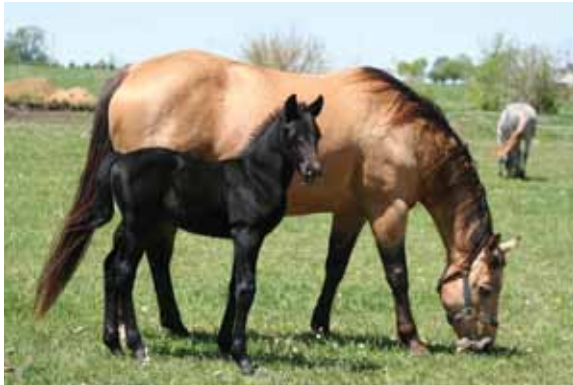
Connemara/Quarter Horse colt born May 7 th sired by *The Quietman

Arbor Lane's Bailey (*Gunsmoke x Foothills Maybee by Balmullo's Beacon) is on lease in West Virginia and had a dun filly sired by *The Quietman on April 1 st . The filly has been named Windy Isles Folly. She will return in foal to the thoroughbred stallion Triple Twist for a halfbred for next year. Triple Twist is one of the last stallions of the Bonne Nuit dynasty and bloodlines that produced such greats as Gem Twist. Should make for a fantastic eventing halfbred.