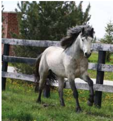
Windy Isles Island Prince

May 7 th our Quarter Horse mare Sadie had a lovely dark bay colt sired by *The Quietman. We have always been extremely pleased with this cross and really like this little colt and are planning on retaining him as a future riding pony.