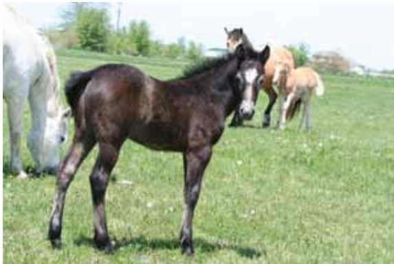
Colt sired by Windy isles Island Prince and out of *Summer Sun

On March 31 st *Summer Sun (Ashfield Jovial Joker x Silver Lady by Thunderbolt) had a lovely black colt to go grey sired by Windy Isles Island Prince. He is still unnamed. We are very happy with Prince's first foals.