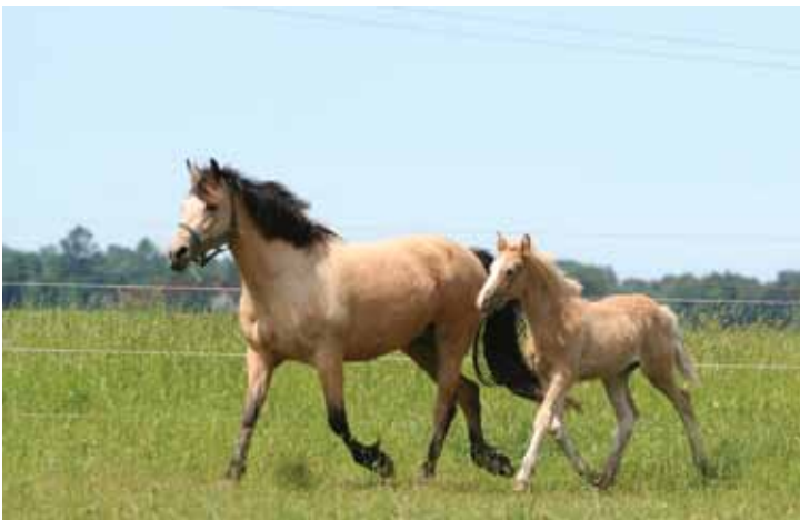
Windy Isles Court Jester (Wildwych Eclipse x *Fairyhill Queen by Fairyhill Hawk)

On April 12 th *Fairyhill Queen (*Fairyhill Hawk x Kingstown Fairy by Village Boy) had a stunning palomino colt sired by Wildwych Eclipse (*Glenormiston Flurry Knox by Wildwych Dreamtime by Aran Milano (AUS)). He has been named Windy Isles Court Jester and we are extremely pleased with this cross. He will not go grey.