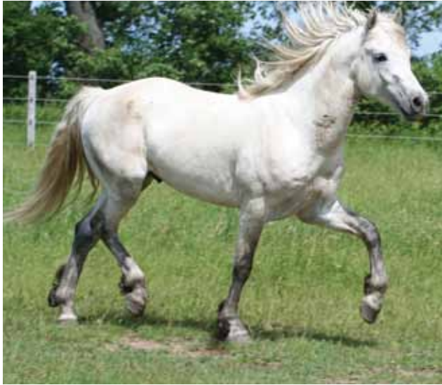
Wildwych Wily Casanova (*Bunowen Castle Ri x *Rudgeway Silver Filigree by Oxenholm Matador)