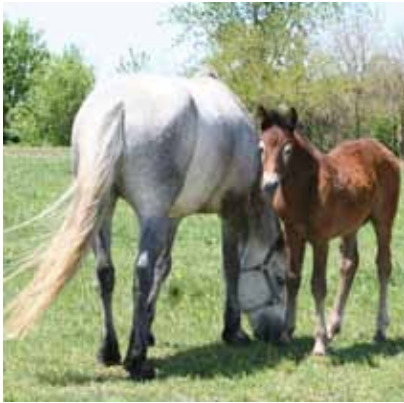
Windy Isles Belle Starr (W.I. Island Prince x W.I. Quiet Lady by *The Quietman)

Prince (Premium Stallion *Coral Bobby x *Fairyhill Queen by *Fairyhill Hawk) she has been named Windy Isles Belle Starr and is an extremely people-friendly and curious filly.