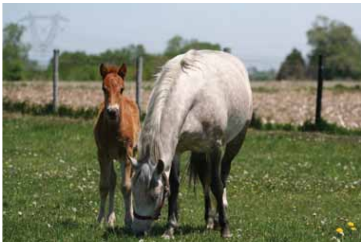
Colt sired by *The Quietman out of *Kilmurray Aisling Owen

On April 15 th *Kilmurray Aisling Owen (Glanns Owen x Aislings Dream by Westside Fred) had a chestnut to stay colt sired by *The Quietman. He has great bone and substance and a beautiful head.